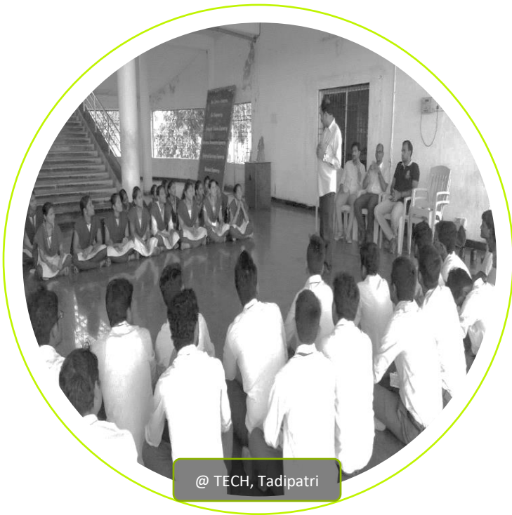
@ TECH, Tadipatri